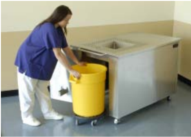
Portable Dumping Station features a 20 gallon mobile braced bucket and stand enclosed in air chamber