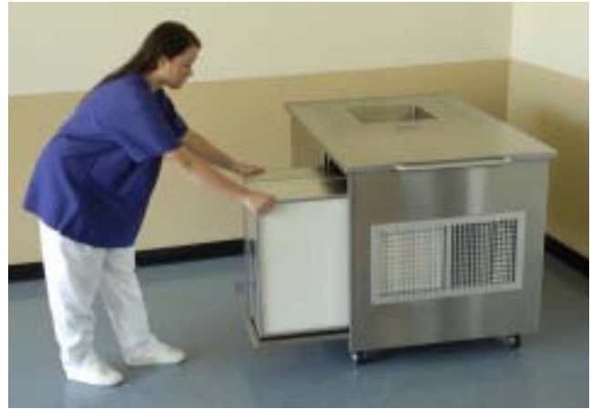
Extra large Hepa filtration with full service access