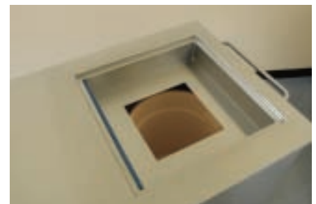
Constructed of all stainless steel for easy cleaning

Mopec's OL100 Downdraft Ventilated Bedding Disposal Station works with virtually any animal cage. Constructed of 16 gauge stainless steel with an extra large 35" x 23" (88.9 cm x 58.42 cm) staging work surface. Stainless steel push handles protrude on both sides of the station. Access doors can be locked for safety. A self contained dust control fume evacuation system combined with a powerful Hepa filtration system offers features necessary for a clean, safe and efficient environment. Downdraft vent cone 15" x 15" (38.1cm x 38.1 cm). Three inch casters, lockable and directional make this unit completely portable from room to room.